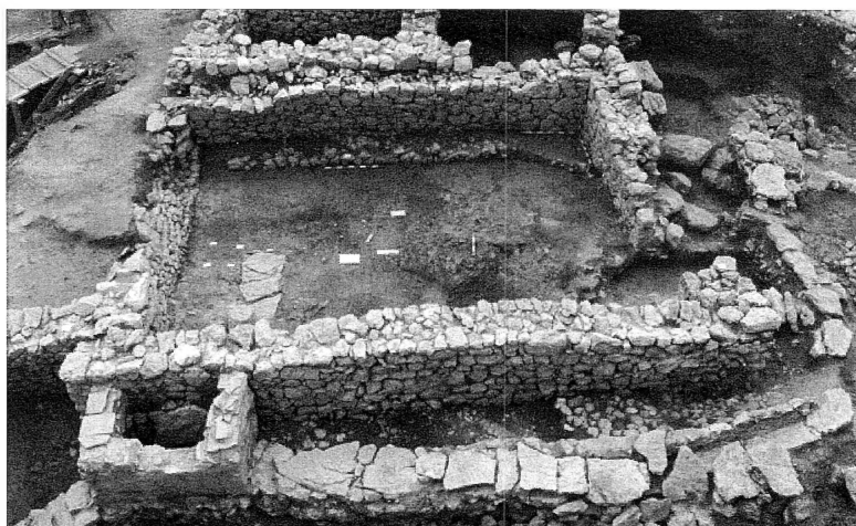
Fig.1 Room "D" – floor level and a sewer north from it, Samuel's Fortress – Citadel, Ohrid

From the rich collection of archaeological material revealed during excavations on the site of the Citadel in Ohrid, two Late Antique eulogiae are particularly significant and will be described in this article. 1 These items of a religious character were discovered during excavations in 2008 - in a disintegrated layer of the Room D. This room was added to a larger Late Antique building located in the northern half of the citadel. (The building has been explored in detail during earlier excavations). The circumstances