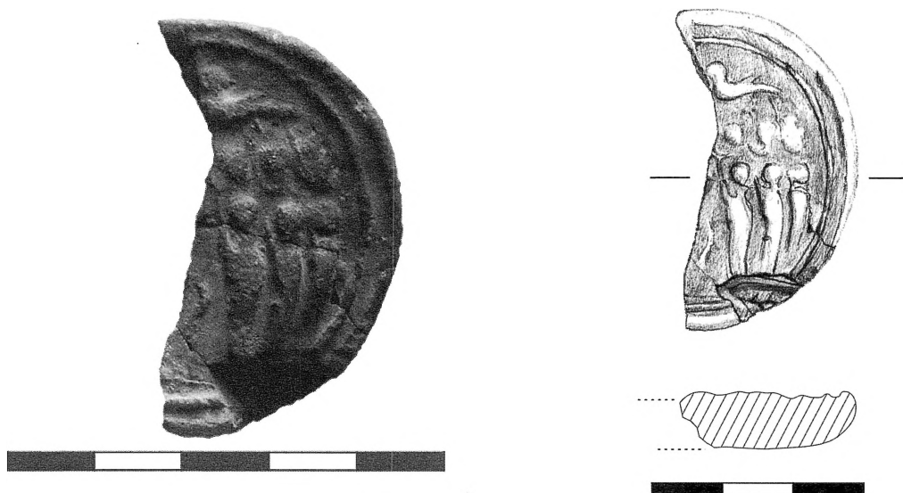
Fig.4, Fig.5 Eulogia with representation of the Ascension of Christ Samuel's Fortress - Citadel in Ohrid

The second eulogia (field inventory number K-8629) is a fragment of a disk with a diameter of 4.8 cm and a thickness of 0.8 cm. (Fig. 4, 5). It is made of fine refined clay of a light grey colour. On one of its sides is depicted the left side of a scene from the New Testament in bas-relief. Six standing figures in two rows of three are depicted facing towards the central part of the composition, which is missing. The figures are not executed with great detail. The first figure on the left in the bottom row has a raised left hand holding a staff. A horizontal line at the end of the staff suggests the figure may have been depicted bearing a cross. The second figure also has a raised left hand, pointing towards the missing upper middle part of the central composition. The third figure in this row is not clearly defined.