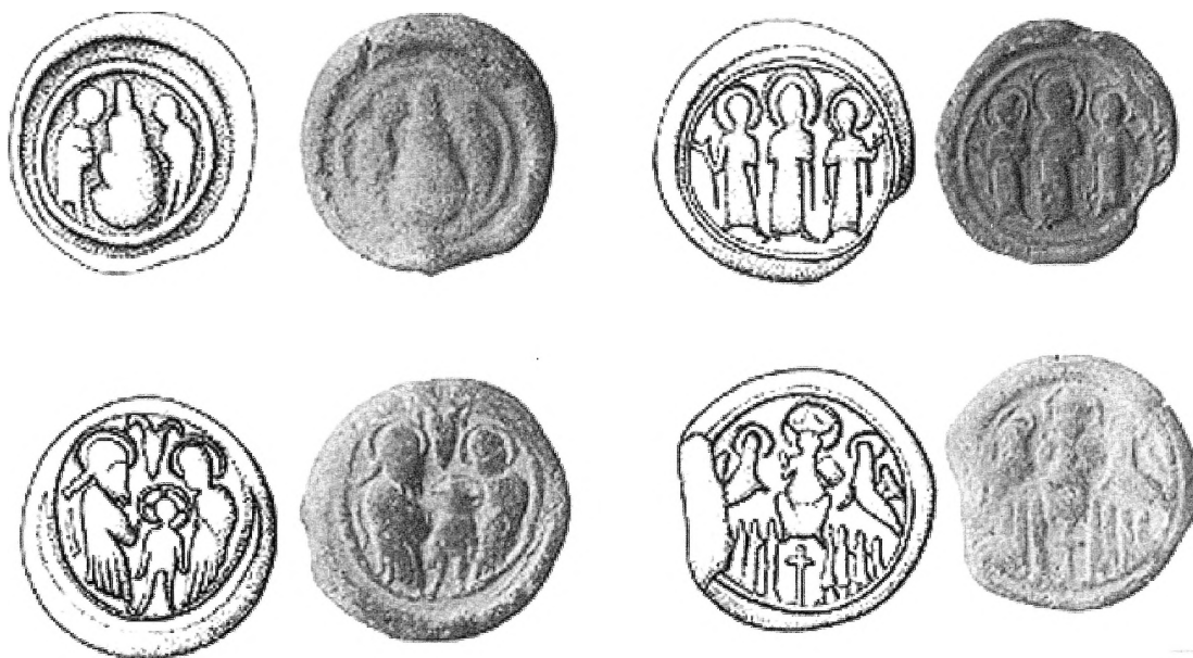
Fig. 6 Ceramic eulogies from the National Museum of Antiquities in Jerusalem

from the late 6 th century: on a miniature icon on a wooden reliquary from Jerusalem; 31 in the form of medallions as part of the Christological cycle on two silver bracelets – amulets; 32 and on an icon from Sinai 33 These outstanding works are considered to be products of the Syrian-Palestinian art tradition, despite some conflicting opinions suggesting that these works were made according to aesthetic principles and influences from Constantinople. 34 Without entering into detailed stylistic analysis of the Ohrid finding here, we must note its closeness in style and date to the abovementioned examples. From this we conclude that the Ohrid eulogia depicting the Ascension of Christ was made in a workshop in Syria or Palestine by craftsmen highly familiar with the artistic and iconographic concepts of early Christian art in the 6 th century.